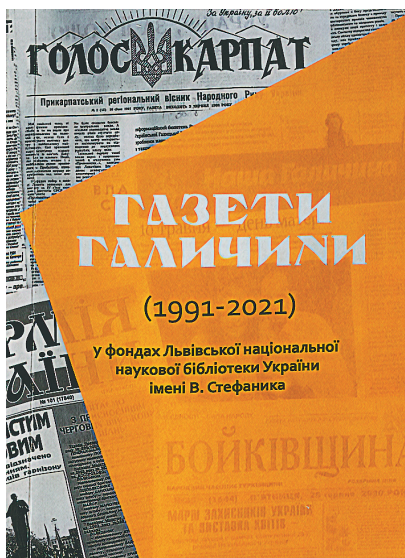
Fig. 1. Layout of the bibliographic index.

The index displays information regarding the names of newspaper publications stored in the Department of Periodicals named after Maryan and Ivanna Kotsiv. Therein are indicated their place of publication, the years available in the fund and the topographic code for ordering. The notes provide additional information about changing the name of the newspaper, subordination, etc. The reference and auxiliary apparatus includes two pointers: alphabetical, in which the names of the newspapers are indicated alphabetically, and geographic, where all the names of newspapers published in a certain settlement (city, town, village) are listed. The name of the settlement is reproduced according to the back then usage and spelling in newspapers.